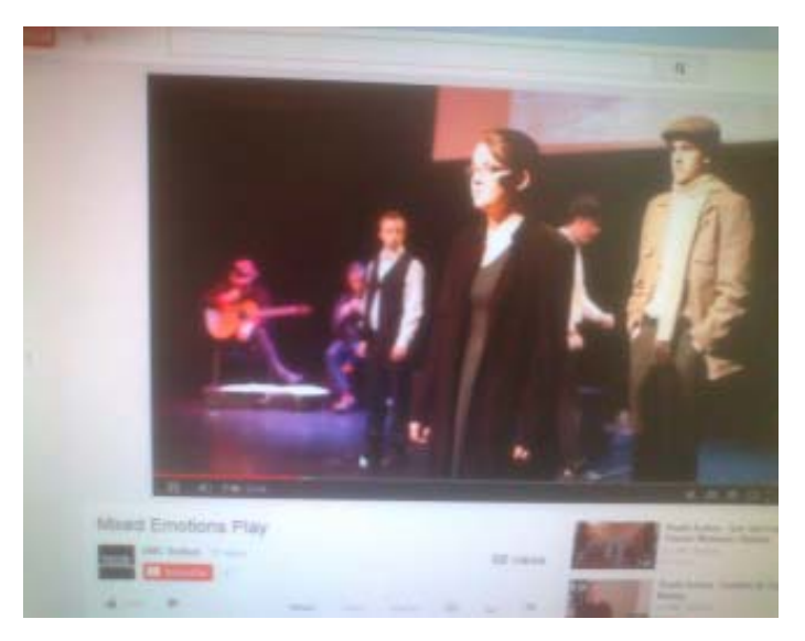
The cast of 'Mixed Emotions the play"

The play also takes centre stage on NIMMA's website, with a simple link on the main page taking callers to the online production.